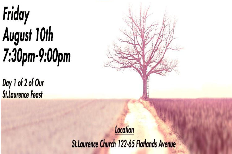
Location St. Laurence Church 122-65 Flatlands Avenue