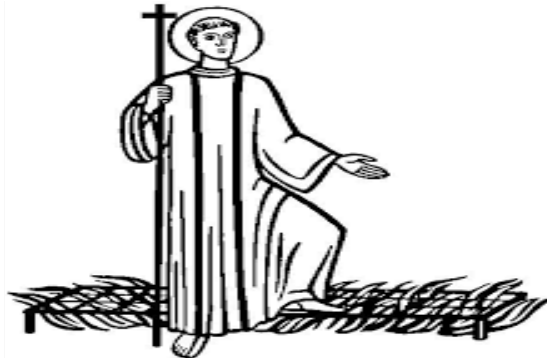
St. Laurence Deacon, Martyr Patron Saint of the Poor